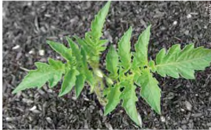
Atomato seedling: Fertile soils produce healthy plants.

Soil fertility depletion has been mostly attributed to insuffi-