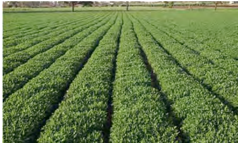
A groundnut farm: A bag fetches twice the price of beans in the market.

Although there are many varieties of grounds (see table), she plants two varieties of groundnuts - Red Valencia and Manipinta. Manipinta is brown and big and is more popular in the market but takes longer to mature, about 4 months. "But the yield per acre is very high and they prefer more fertile soils. They also need to be harvested immediately they are ready, otherwise they get spoiled in the shamba if not harvested on time. They need more rain and care than the other types. Loam soil is preferable if you want good yield," she says.